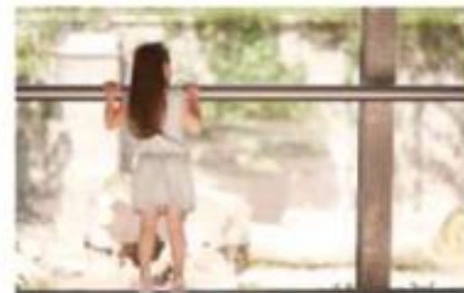
A wall at a zoo