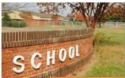
A wall surrounding a school

What do you think each of these walls is used for?