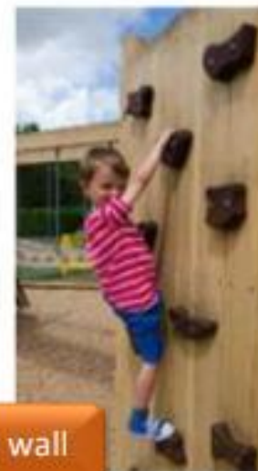
A climbing wall